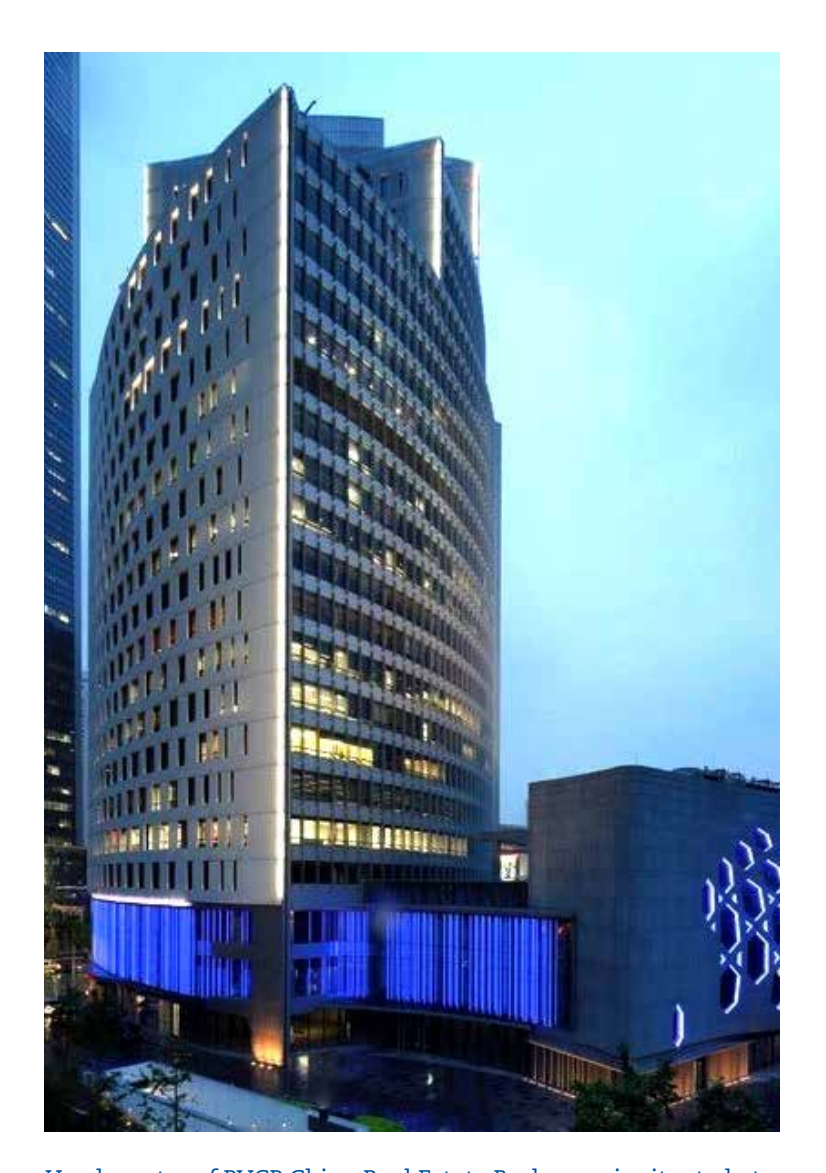
Headquarter of PVCP China Real Estate Brokerage is situated at Room 605, EcoCity, No.1788, Nanjing West Road, Jingan District, Shanghai, CHINA.

Bring the cutting-edge real estate investment philosophy of PVCP Group into Asia Pacific